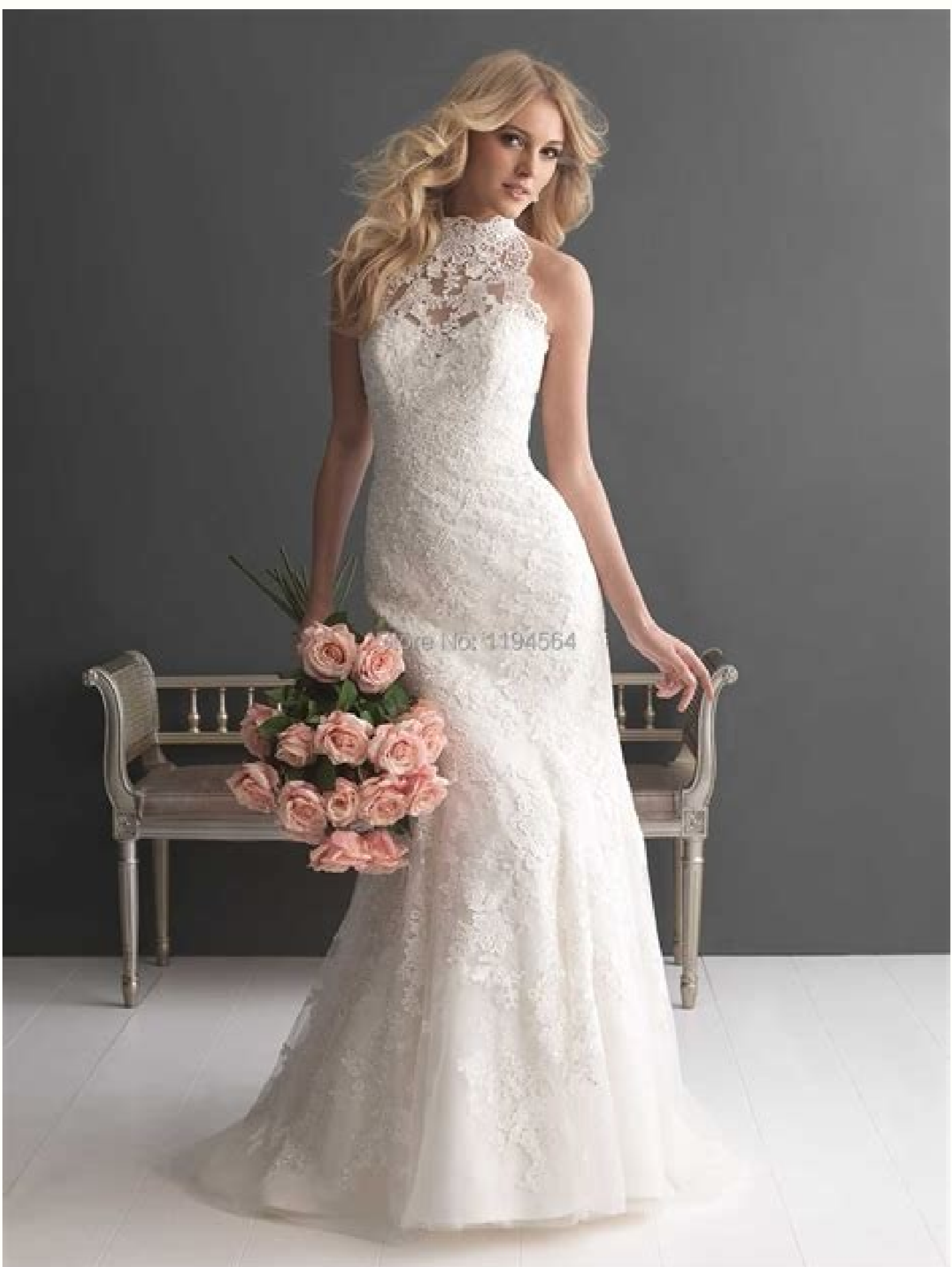
Formal gowns in atlanta ga. Formal evening gowns in atlanta ga.